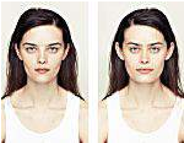
Photo Series Constructs Symmetrical Faces To Test Traditional Notions Of Beauty