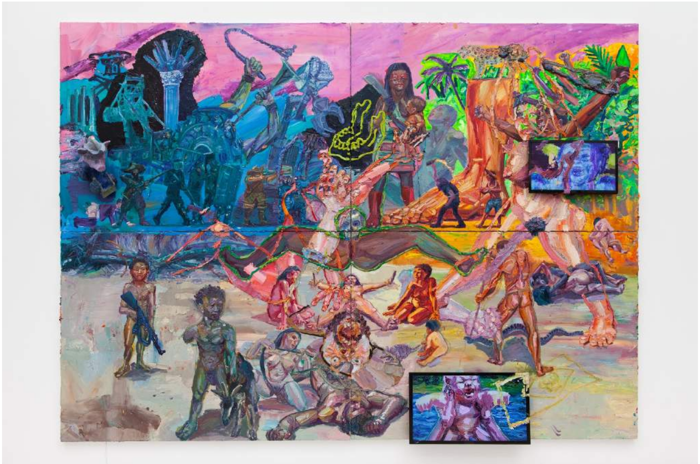
A reencarnação do bandeirante no ventre vermelho. Oil on canvas and two TV monitors with stop motion animation, 260 x 360 cm

Museum and the Kunsthal KAdE Museum in the Netherlands, Martins de Melo's creative process continues to develop and evolve. "Making movies and working with the sound is something that I will continue doing and experiencing hereafter," he says. "I've reached a point that I cannot and do not want to go back."