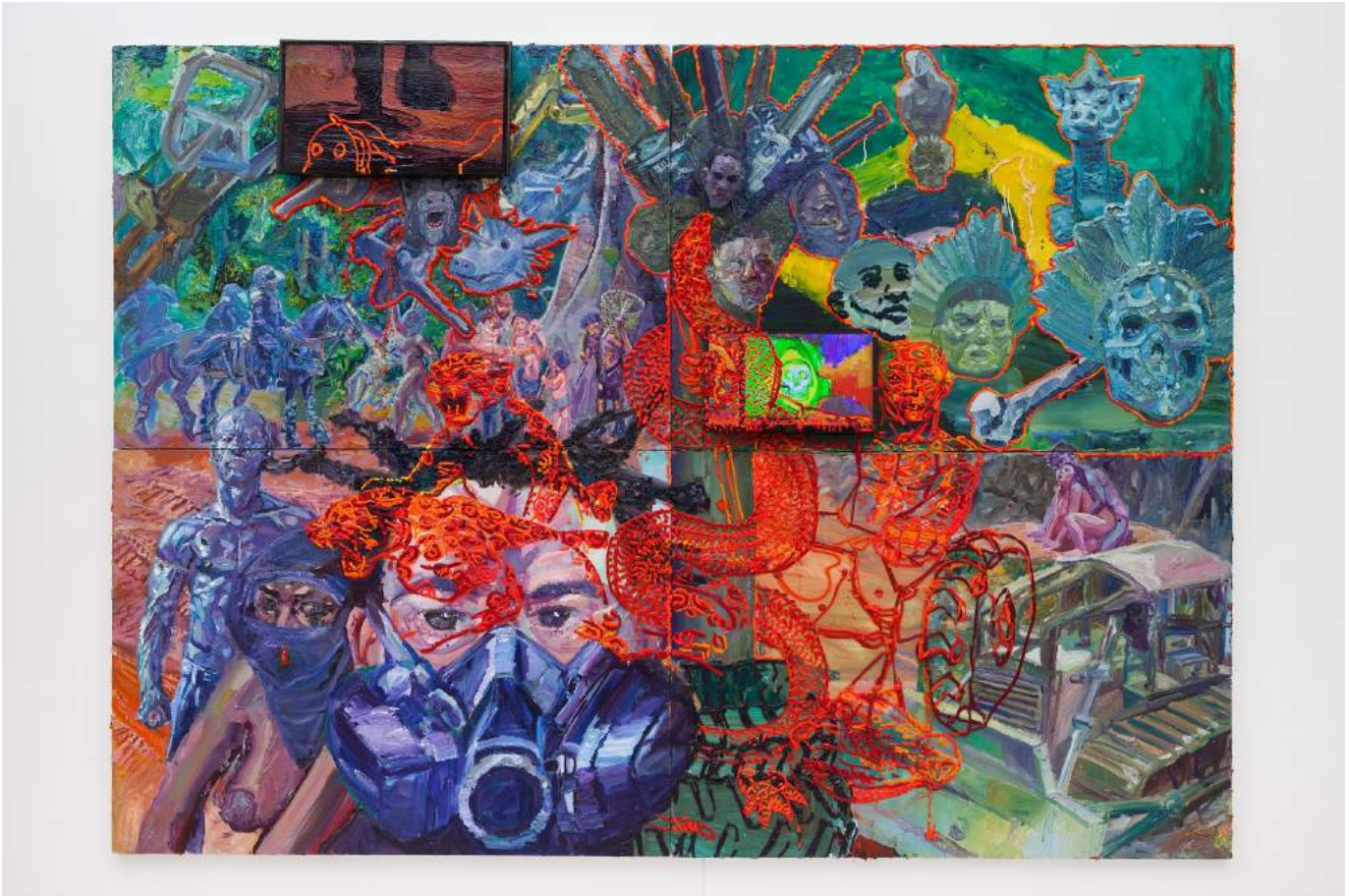
A biga do porta-bandeira vermelho. Oil on canvas, polyester and polyurethane resin, two TV monitors with stop motion animation, 260 x 360 cm.

Artists around the world have always brought to life revolutionary ideals through art, and in a blooming art scene with a powerful heritage like Brazil's, it's not surprising that many creative discourses convey a compelling social message. T