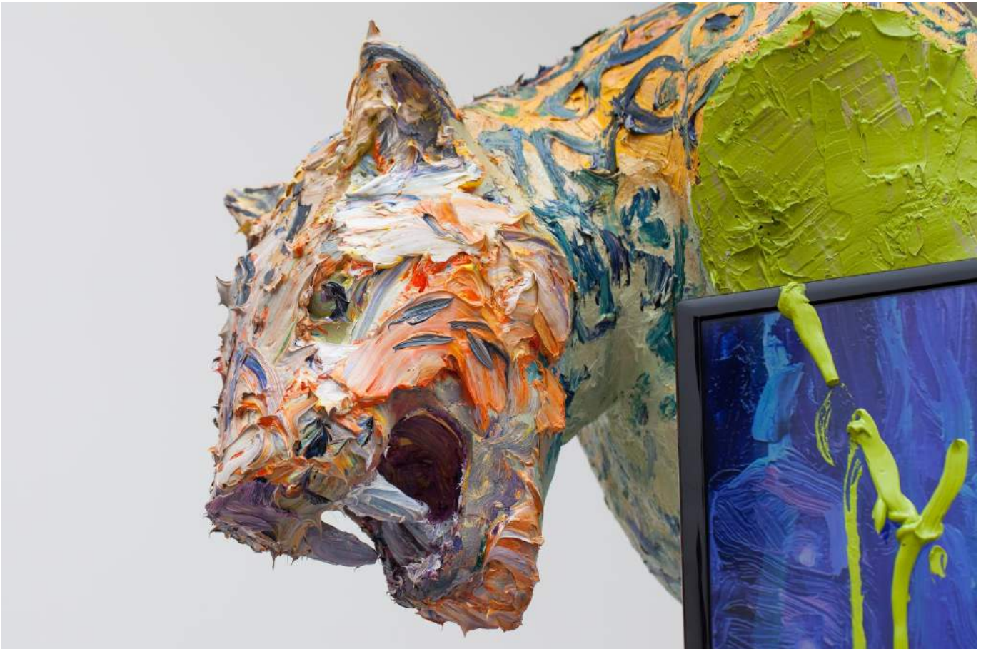
Coluna que anda sobre garras. Oil on fiberglass with resin, polyurethane and two TV monitors with stop motion animation, 245 x 197 x 70 cm

stop-motion animations that bring a strong narrative and composition into play. "We live in an incredible age to work with painting," he tells The Creators Project, "from the most basic materials like pigments to software, the world is a database of immeasurable images that continues to grow exponentially. Painting will continue to live with the help of new technologies."