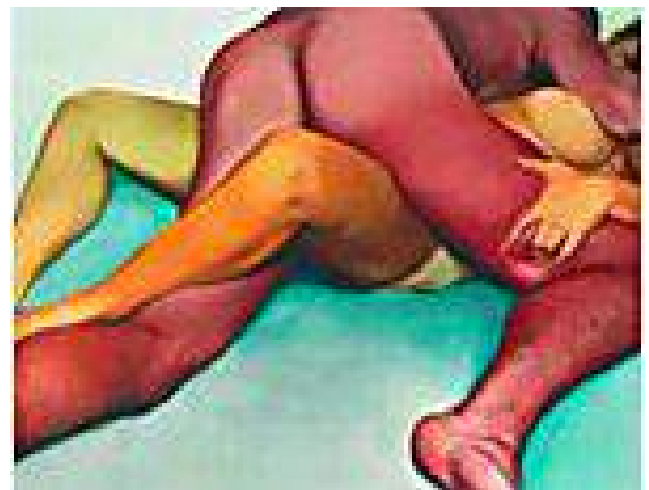
[NSFW] Erotic Feminist Art Gets a Second Look