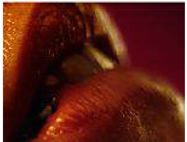
Click Here for Guilt-Free Porn